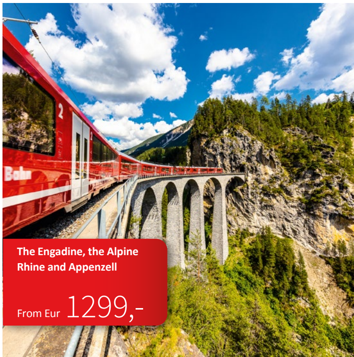
The Engadine, the Alpine Rhine and Appenzell

DAILY ROUTE LENGTH ●●●●● TOPOGRAPHY ●●●●●