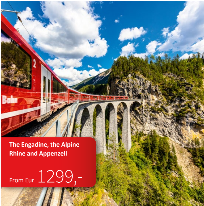
The Engadine, the Alpine Rhine and Appenzell

DAILY ROUTE LENGTH ●●●●● TOPOGRAPHY ●●●●●